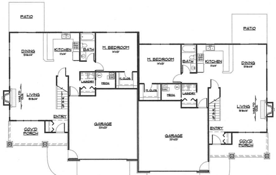
MAIN LEVEL PLAN 1120 sq. ft.