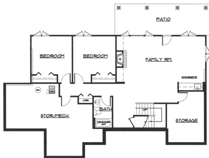
LOWER LEVEL PLAN 1732 M.L. + 1107 L.L. = 2839 SQ. FT.